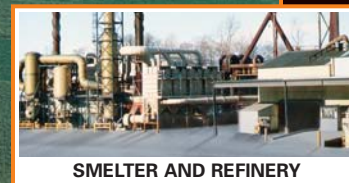
SMELTER AND REFINERY