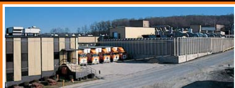
INDUSTRIAL BATTERY PLANT

Since 1946, East Penn has been producing high quality batteries for the industrial, automotive, commercial, marine, stationary and specialty markets. East Penn is an independent company dedicated to producing a world class product.