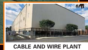
CABLE AND WIRE PLANT