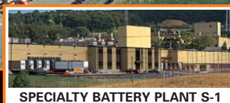
SPECIALTY BATTERY PLANT S-1