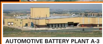
AUTOMOTIVE BATTERY PLANT A-3