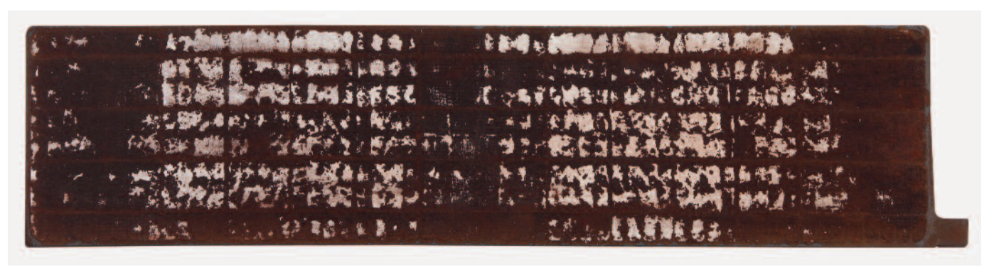
Competitor's plate formed in the battery case. White areas indicate plate is not fully formed.

a mixture of sulfuric acid, water, and a specially formulated lead oxide. Deka Unigy VRLA battery oxide is made with pure virgin lead (99.99%) and manufactured with a proprietary and exclusive formula made on-site at its own oxide mills. A unique computerized mixing system allows the combination of these materials to be precisely mixed into a paste-like consistency. The paste is uniformly and automatically applied to the grid by computer-integrated pasting