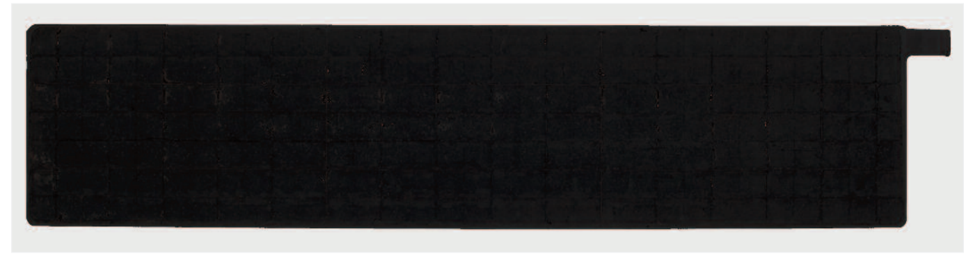
Fully formed Deka plate using IPF™ TECHNOLOGY. This superior process is exclusive to East Penn.