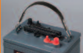
CONVENIENT LIFTING HANDLE

QUALITY SYSTEM CERTIFIED ISO 9001 ISO/TS 16949 ENVIRONMENTAL SYSTEM CERTIFIED ISO 14001